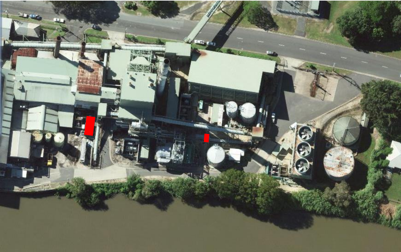
Figure 1. Site Layout of Condong Cogeneration Plant indicating primary Chemical Storage Areas in red.